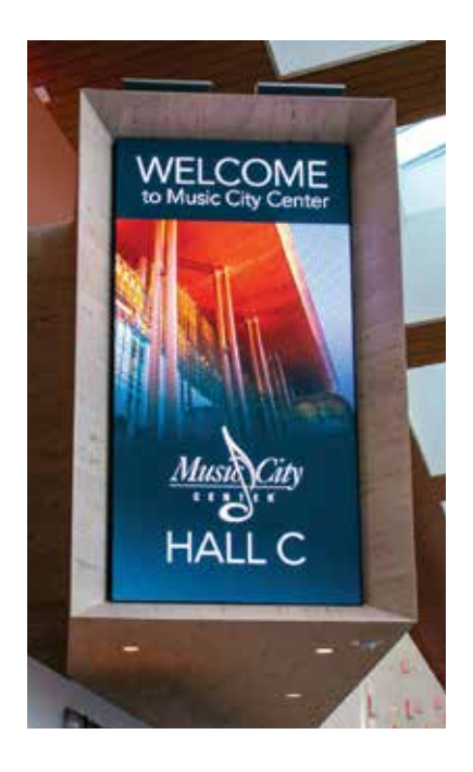
Exhibit Hall Dormers $2,000 per still image (10 second intervals)

A single screen towers overhead on Level 2 near the 6<sup>th</sup> Avenue and Demonbreun Street entrance. The 16'W x 9'H LED display offers more than 252" of screen coverage that can be divided into sections. This wall accommodates still images and video.