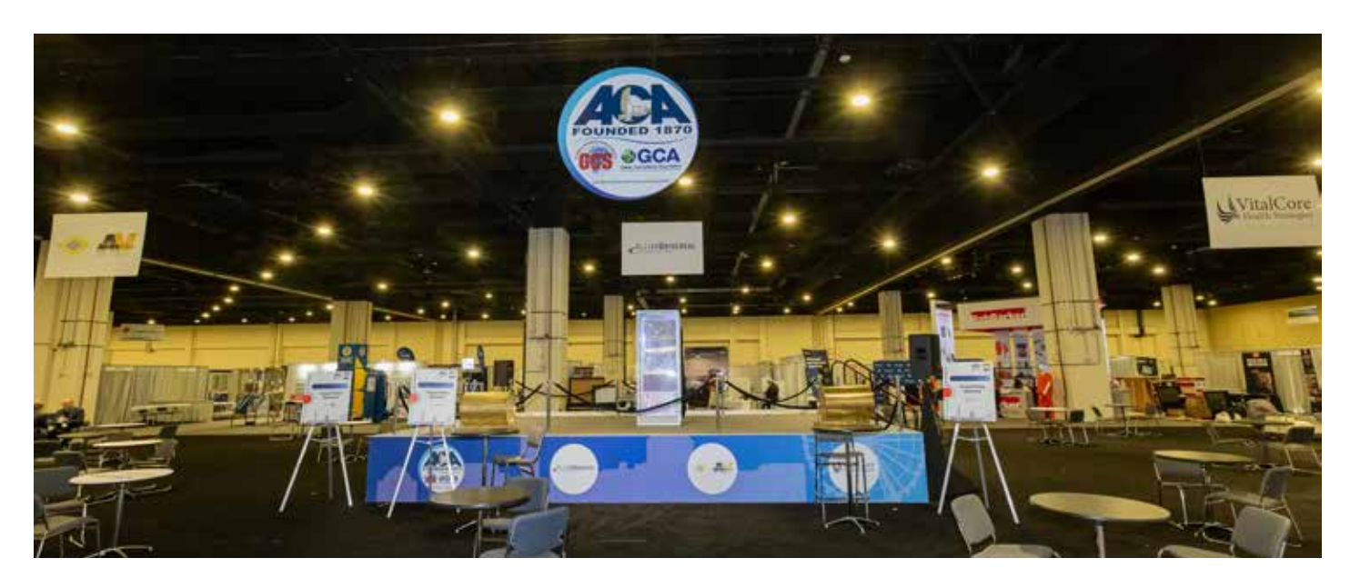
*Sponsor responsible for all costs associated with this sponsorship.

on each bag. Your company name will be in front of everyone in attendance on a daily basis.